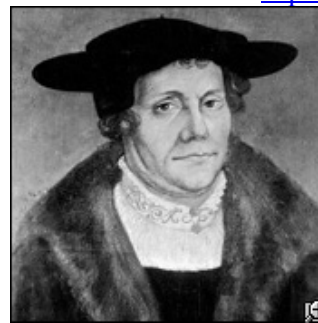
Martin Luther: Toilet Writer

Oct. 25, 2004 — German archaeologists have discovered the birthplace of the Protestant Reformation — a stone toilet on which the constipated Martin Luther wrote the Ninety-Five Theses that launched the creation of Europe's Protestant churches.